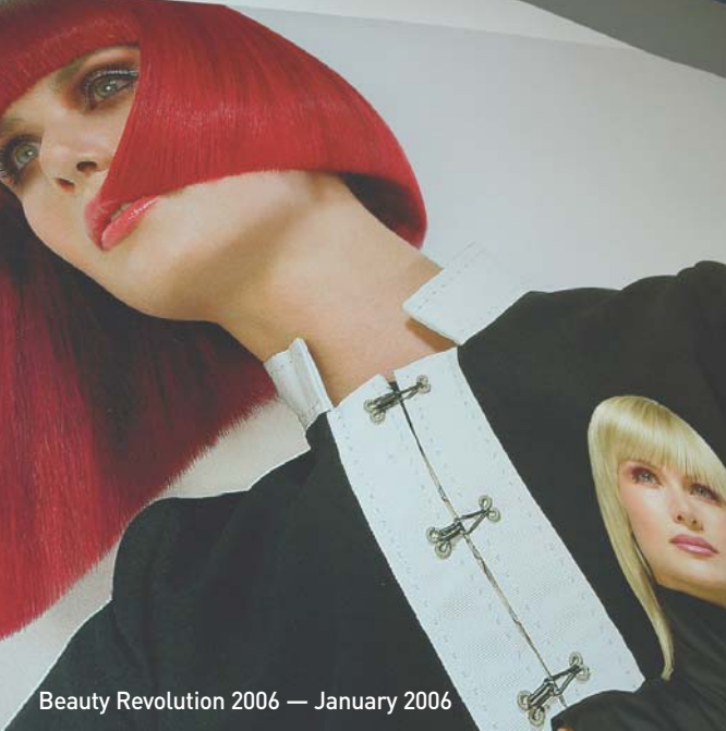
Beauty Revolution 2006 — January 2006