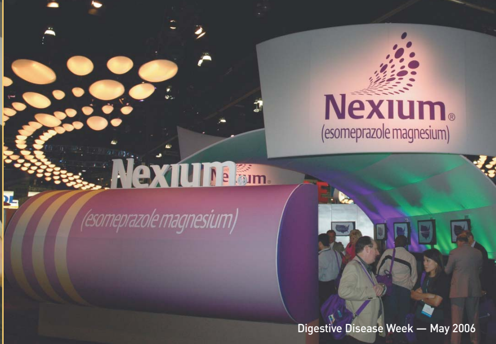
Digestive Disease Week — May 2006