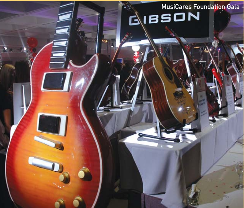
MusiCares Foundation Gala — February 2006